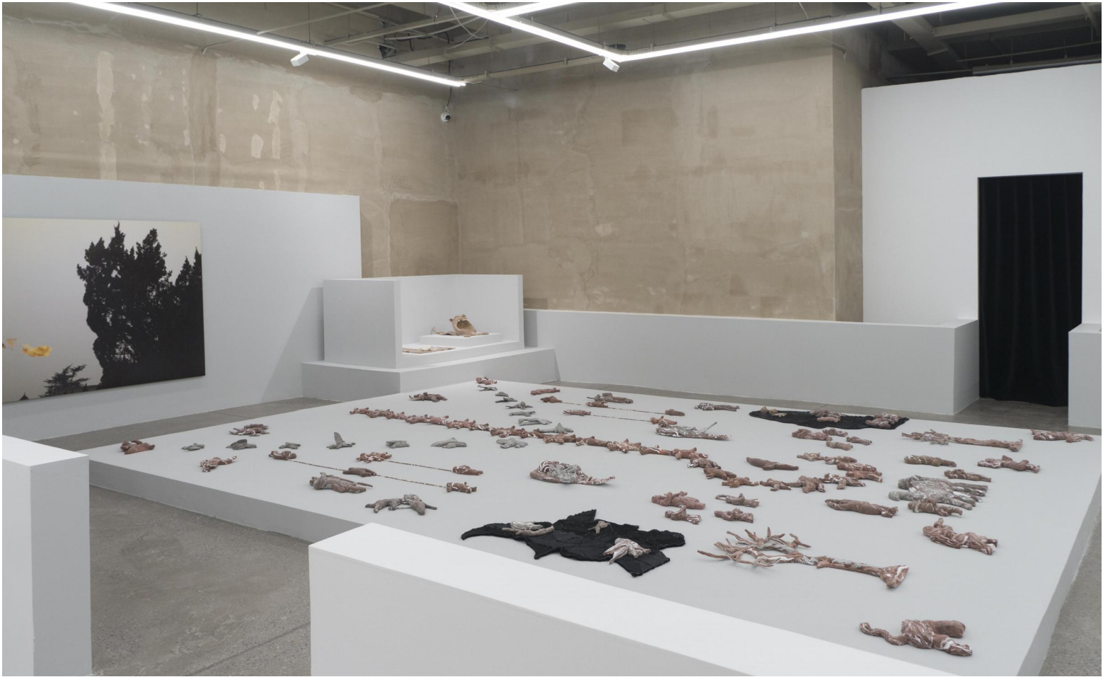
展览现场 Exhibition View